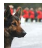
The week in Pictures April 10-16,2011

ANNOUNCEMENTS: Obituaries | Births | Cards | InMemoriams | Milestones