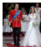
Kate & William A royal wedding