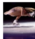
Week in Pictures April 17-23